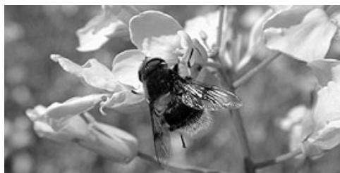
Bee on oilseed rape. Studies with oilseed rape (Brassica napus) have made useful contributions to the GM debate - SCRI has been involved in farm-scale evaluations of herbicide resistant GM crops

At SCRI, studies with oilseed rape ( Brassica napus ) have looked at evolution in fragmented populations. Measuring and predicting crop purity has become necessary following applications by seed companies to grow GM crops in Europe. SCRI was part of the independent consortium involved in farm-scale evaluations of herbicide-resistant GM crops for the UK government, looking at the effects of these crops on arable food webs, feral populations, competition and gene exchange with feral, wild or nearby crop species. For more information on the farm-scale evaluations, see Further reading .