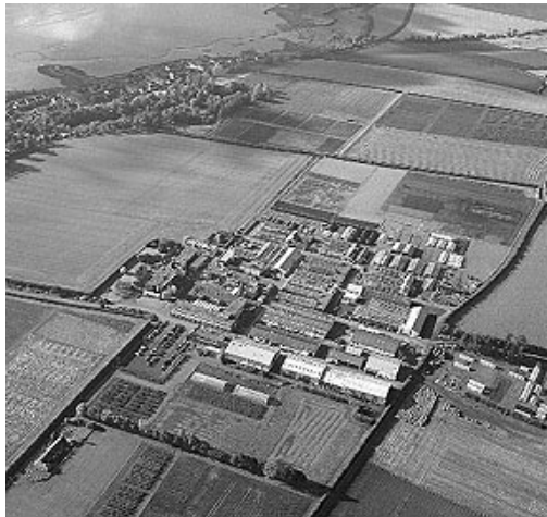
Aerial view of the Scottish Crop Research Institute (SCRI), an important centre for research in plant biotechnology and improvement of crop plants

Mechanisms and Processes, Genes to Products and Management of Genes and Organisms in the Environment. Research focuses on three main crops (potato, barley and soft fruit) and a number of pathogens and pests, with additional work on a wider range of temperate crops.