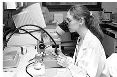
A sixteen year old "Nuffield Bursary" school student, carrying out a 6-week laboratory based project, during the summer of 2003, with assistance from SCRI scientists